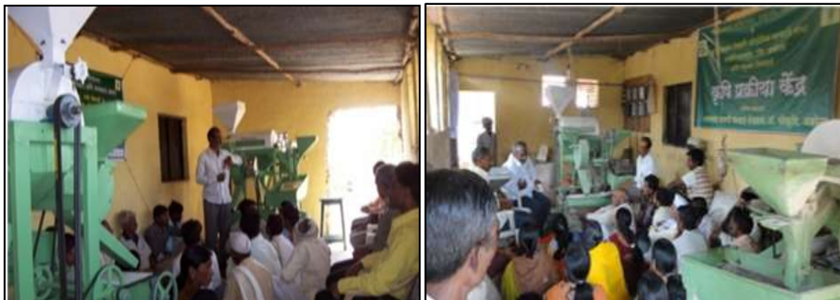
Entrepreneurship development through Agro Processing Centre