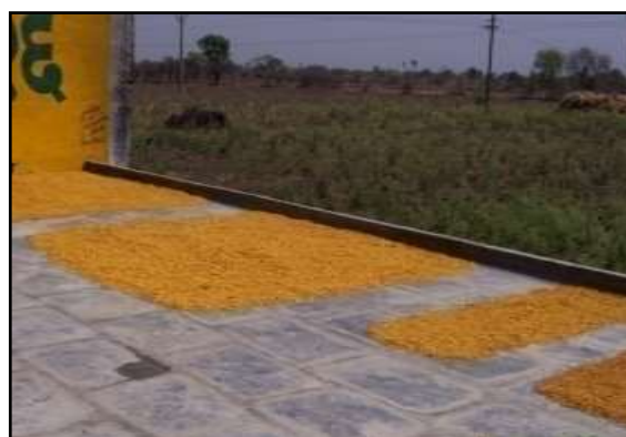
Drying yard at APC