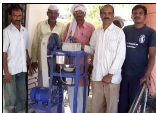
Installation of Shevai machine