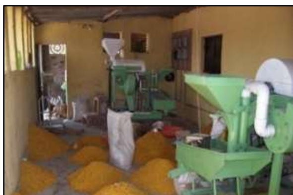
Processed Dal at APC

(E – Electricity charges, L – Labour charges and O – Oil charges)