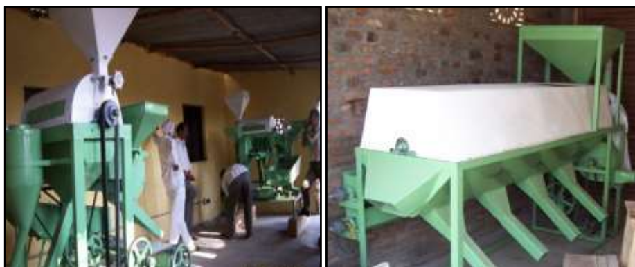
Installation of PKV mini dal mill PKV cleaner/grader cum polisher