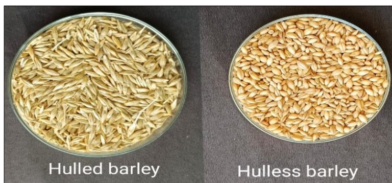
Fig 1: Hulled and Hullless barley grains

Values are expressed as mean \pm standard deviation